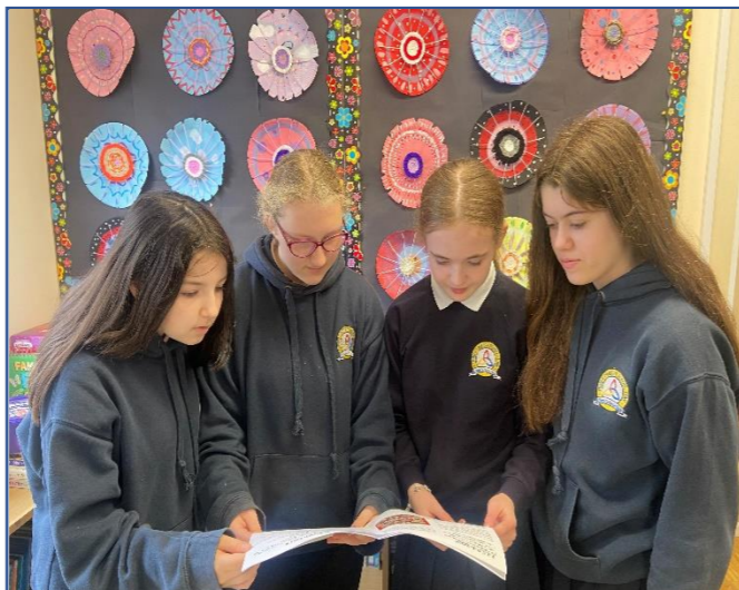
Some of our Deputy Editorial Team!