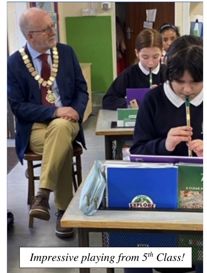
Impressive playing from 5 th Class!

It was an insightful experience for all to have such an important figure in our school and to show him how we run here in Trinity Primary School!