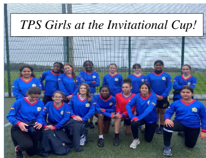
TPS Girls at the Invitational Cup!