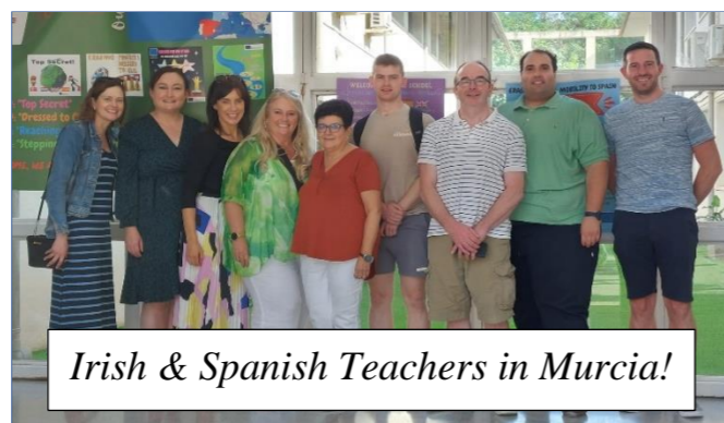
Irish & Spanish Teachers in Murcia!

A: Sure, pencil is lápiz, pencilcase is estuche, computer is computadora, rubber is goma, book is libro and a tablet is the same!